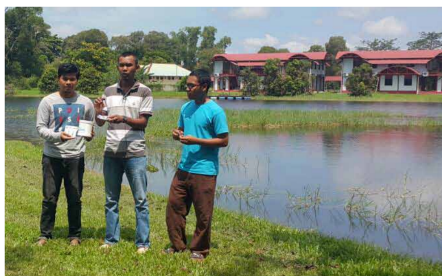
River Monitoring: Water Quality Testing

The key activities are project discussion and meeting with stakeholders, river walk programme, river/ lake clean up, water quality monitoring and river rehabilitation activity.